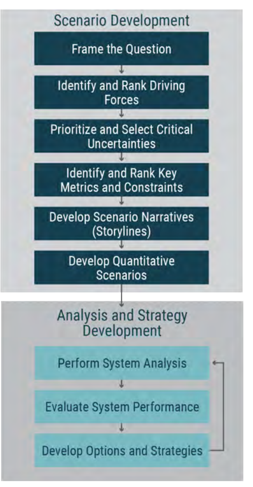
Figure 3 Scenario Planning Process

1. Summarize the questions, driving forces, critical uncertainties, system performance metrics, and key constraints that need to be considered in a draft technical memorandum. Because System performance metrics are measures that indicate the ability of the GSL system to meet basin resource needs under multiple future