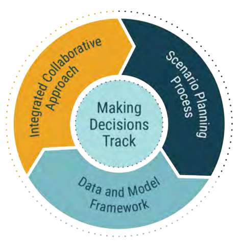
Figure 1. Three Components of the Making Decisions Track of the Work Plan

comprises diverse interests (nonstate and federal agencies) from across the entire GSL watershed and was originally formed in July 2023 to advise in Work Plan development. The GSLBIP Advisory Group (AG) comprises representatives from participating state and federal agencies and was formed in June 2022 to advise Utah Division of Water Resources (WRe) efforts to implement House Bill 429.