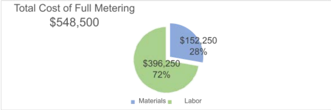
Chart 1. Total cost of full metering.