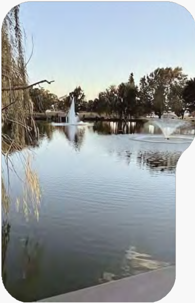
North Pond in Rees Pioneer Park